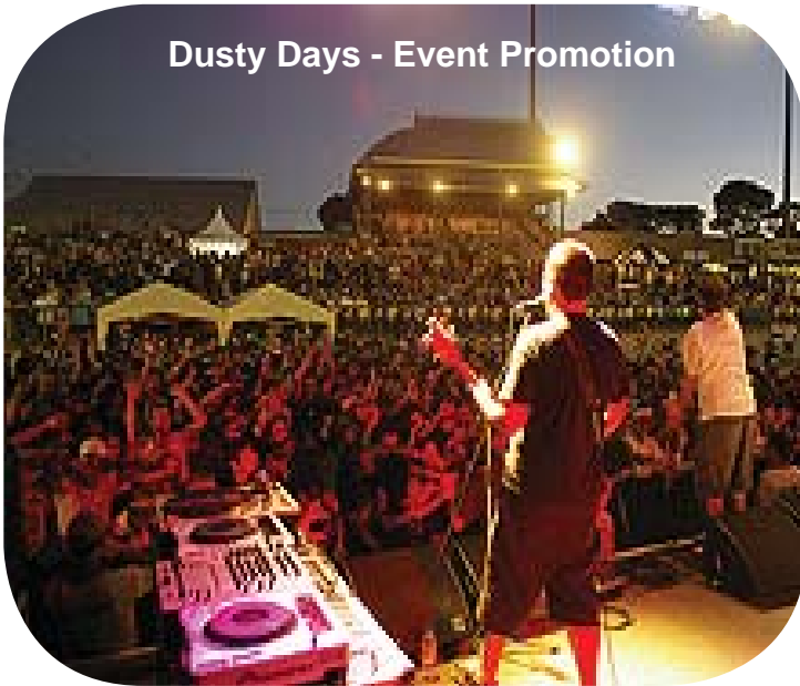
Dusty Days - Event Promotion