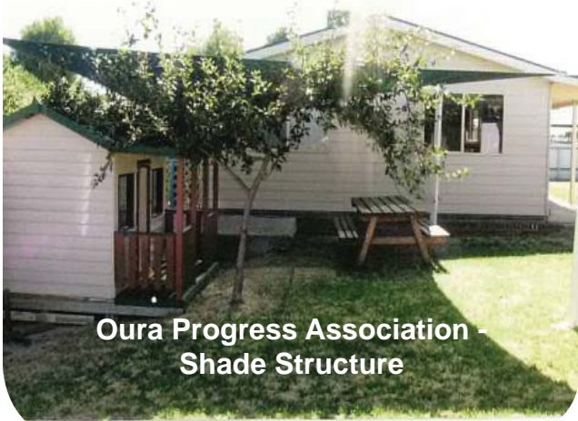
Oura Progress Association - Shade Structure